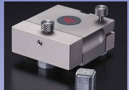
TriPod for parallel polishing